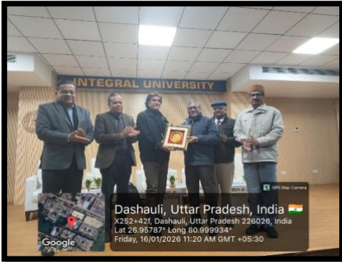
Dashauli, Uttar Pradesh, India X252+42f, Dashauli, Uttar Pradesh 226026, India Lat 26.95787° Long 80.999934° Friday, 16/01/2026 11:20 AM GMT +05:30