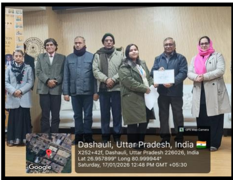
Dashauli, Uttar Pradesh, India X252+42f, Dashauli, Uttar Pradesh 226026, India Lat 26.957899° Long 80.999944° Saturday, 17/01/2026 12:48 PM GMT +05:30