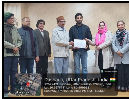
Dashauli, Uttar Pradesh, India X252+42f, Dashauli, Uttar Pradesh 226026, India Lat 26.957878° Long 80.999958° Saturday, 17/01/2026 01:57 PM GMT +05:30