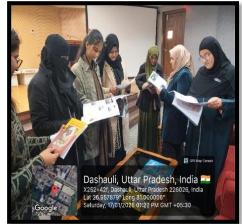
Dashauli, Uttar Pradesh, India X252+42f, Dashauli, Uttar Pradesh 226026, India Lat 26.957879° Long 81.000006° Saturday, 17/01/2026 01:22 PM GMT +05:30