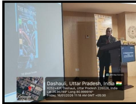
Dashauli, Uttar Pradesh, India X252+42f, Dashauli, Uttar Pradesh 226026, India Lat 26.95789° Long 80.999916° Friday, 16/01/2026 11:18 AM GMT +05:30