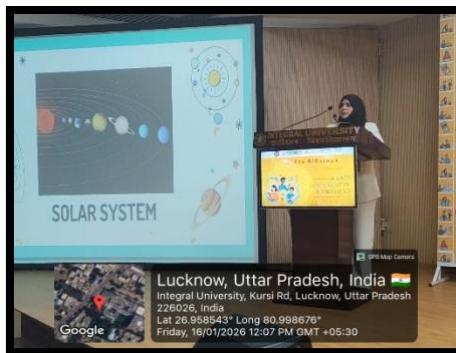
Lucknow, Uttar Pradesh, India Integral University, Kursi Rd, Lucknow, Uttar Pradesh 226026, India Lat 26.958543° Long 80.998676° Friday, 16/01/2026 12:07 PM GMT +05:30